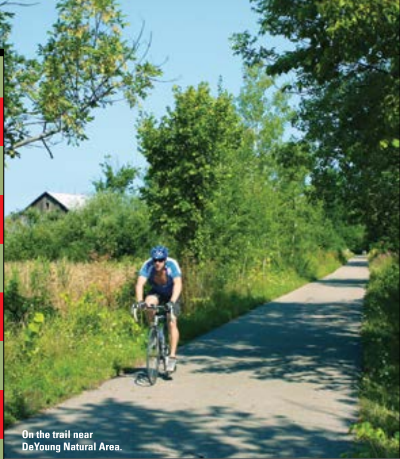
On the trail near DeYoung Natural Area.